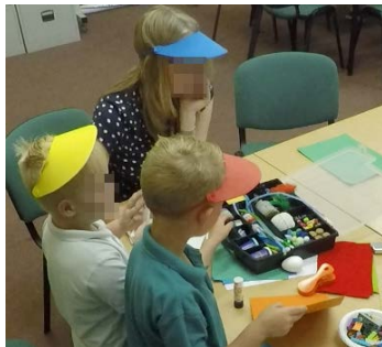
Figure 2: The modified “box of multisensory stuff” (above) included crafting materials that provided different affordances in different modalities in-line with children’s interest, e.g. pronounced visual appearance, unusual tactile experience, audio recorders, flavours and scents. A compartmentalized organization of materials made it easier for both children with and without visual impairments to access the materials independently during the workshops (below).

preliminary research on designing a joint storytelling tool for mixed visual abilities.