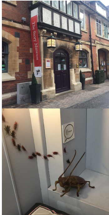
Figure 1: Images from the field visit to The Story Museum, Oxford.